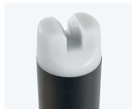
Turbimax CUS50D sensor

because of corrosion. Also, commonly available plastic turbidity sensors are not resistant to the high temperatures of maximum 60 °C. An additional phenomenon which could cause problems in this process is fouling of the sensors' optics, despite the very smooth sensor surface. This needed to be taken into account beforehand.