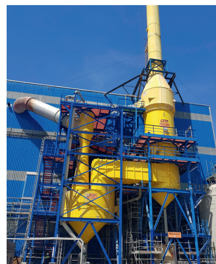
Gasscrubber at Rosier Sas van Gent-site

Customer challenge An inline concentration measurement will improve the production process and minimize downtime of the installation. It would be ideal to prevent the suspended solids concentration from becoming too high. But, conventional suspended solids sensors based on the NIR light reflection turbidity principle do not correlate sufficiently if different liquids are used. Furthermore, due to the high chlorides concentration, stainless steel sensors cannot be used