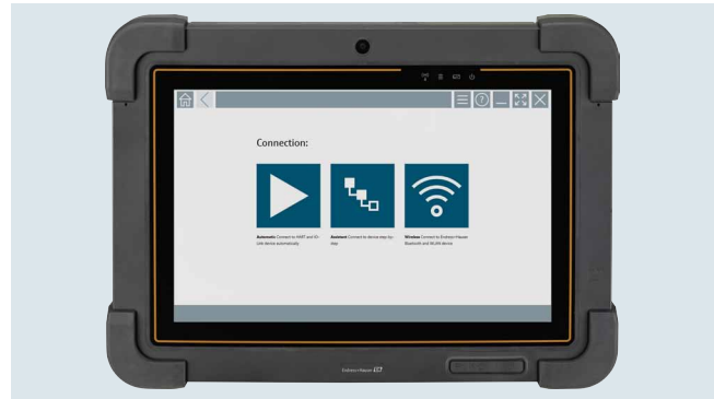
Field Xpert SMT77