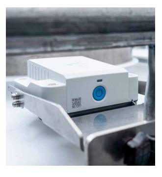
Micropilot FWR30 mounted on an IBC