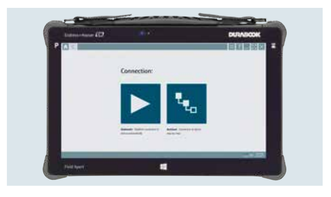
Field Xpert SMT70