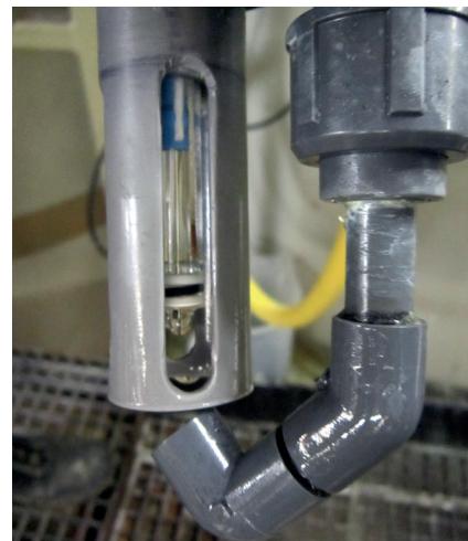
Via the nozzle, the pH+ORP sensor is flushed periodically

Besides the optimization of chemical dosing, AHC Benelux BV is also working to improve their main production process. For instance, future steps are aimed at cyanide-free galvanizing baths to further improve their environmental management.