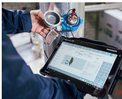
Field Xpert SMT70 offers many useful features

The Field Xpert SMT70 software is intelligent and powerful. “With this we now have a beautiful mobile platform that will allow us to move forward for a few years to come”, says the E&I responsible. “In addition to the enormous ease of use, the new tablets also provide a clear speed gain. They connect very quickly to the instruments, which you can immediately check for correct operation. If you change the parameter settings ‘in the field’, a new PDF will be created immediately. If you put the tablet in the docking station when you return to the office, the PDF is automatically placed on the server so that the instrument data is always up to date. This is also a great advantage when replacing such an instrument. We now have three Field Xpert SMT70 tablets in use and are still discovering new useful features. Everyone in the department likes to work with them.”