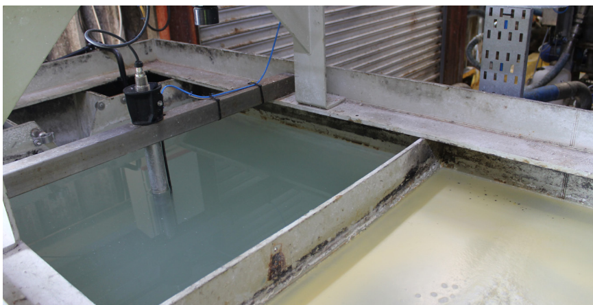
Memosens CAS80E in treated effluent tank

into recirculation, meaning no water is discharged to the sewer until the effluent has been manually checked and the outfall reset. "The automation is a fail-safe," explains Matthew Routledge, "particularly on nights when there are less people on shift. I've set the limits very conservatively in the COD probe so it kicks in a lot earlier than our actual limit with Yorkshire Water."