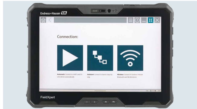
Field Xpert SMT50B