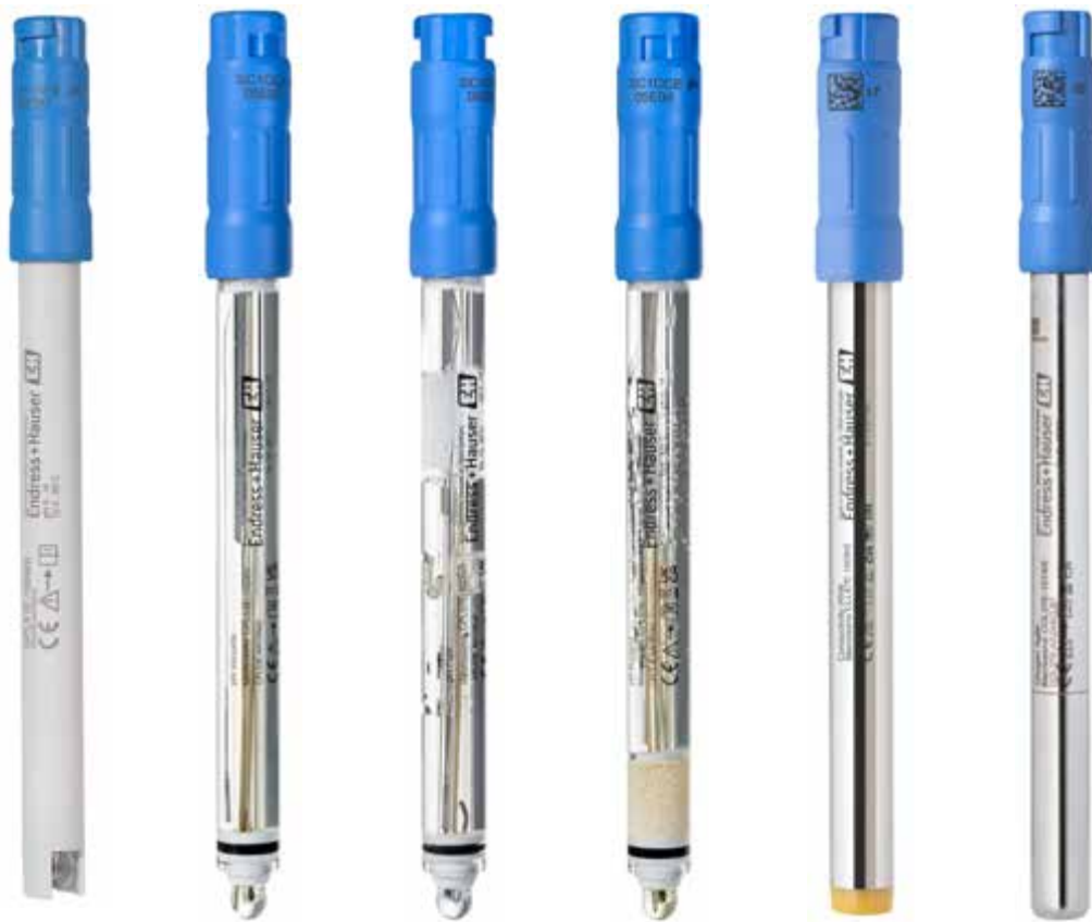
pH lab sensors Memosens CPL51E, CPL53E, CPL57E, CPL59E, conductivity sensor Memosens CLL47E and oxygen sensor Memosens COL37E

Memosens 2.0 sensors give you an outstanding measuring performance in combination with excellent usability and traceability. The laboratory sensors use the same super powerful microprocessors, to transform the measured values to a secure digital signal. This digital signal is transferred over the inductive Memosens coupling. This combination is extremely robust and absolutely unaffected by environmental interferences such as water, humidity or dirt. The microprocessor inside the sensor head stores the actual and historical adjustment values as well as values from the factory calibration. To make your GLP documentation easy, sensor identity with serial numbers and order codes are stored in parallel to measured values. Sensor data e.g. hours used and manufacturing date can be visualized over Memobase Pro app.