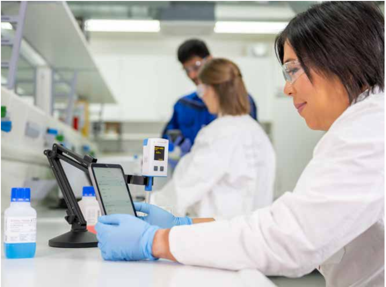
Document your measured values quickly and easily with the Memobase Pro app