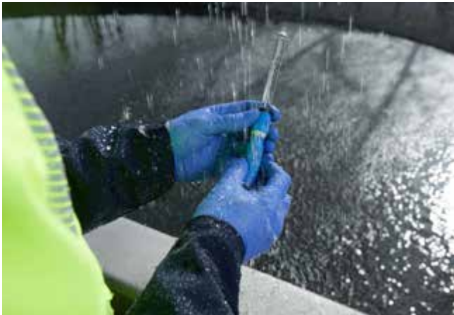
Memosens sensor connection is unaffected by water, humidity and dirt