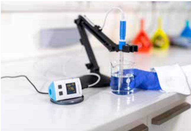
A real space saver, one compact instrument for many parameters