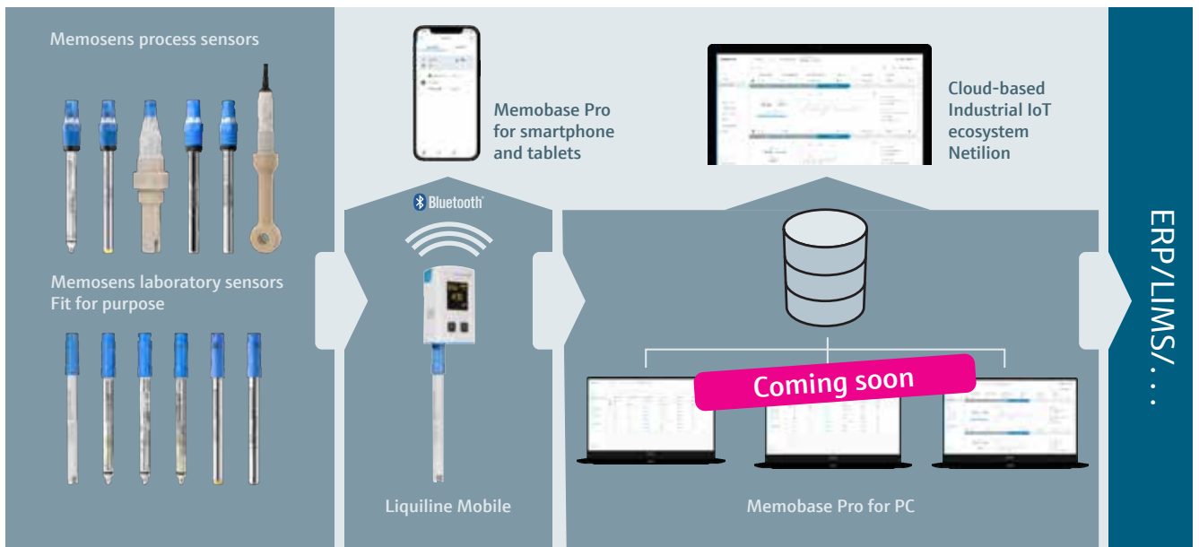
Endress+Hauser laboratory ecosystem with sensors, mobile handheld device and software