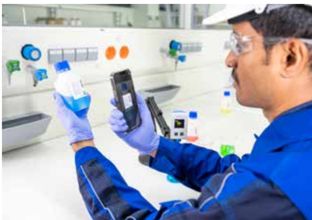
Scan buffer or sample information with your smartphone camera, all data is automatically captured and saved in Memobase Pro app

Measurement values are saved just by a touch of the button on Liquiline Mobile CML18 handheld or by the surface of your smartphone/tablet. Wherever you work, we keep the usability and measuring reliability in the forefront.