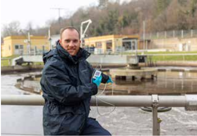
Oxygen measurement in the aeration basin of a wastewater treatment plant

pH, dissolved oxygen and conductivity measurements with unique Memosens technology