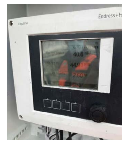
Liquiline CM442 showing measured values: Channel 1: Turbimax CUS50D (Tested device) measured values are below the measuring range of the device. Channel 2: Turbimax CUS52D. Channel 3: Turbimax CUS71D

Given the improvements in terms of measurement in the thickener, Marcos Orellana indicates: "The installed equipment gives us a reliable measurement and allows us to better monitor these process variables and contributes to a more efficient operation of tailings thickeners".