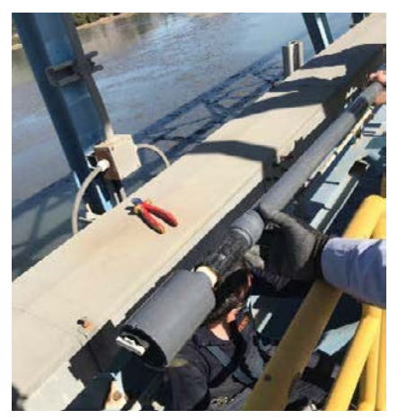
Turbimax CUS71D ultrasonic interface sensor immersed in clarified water mirror; assembly installation is carried out on the bridge of the thickener N^{\circ}2