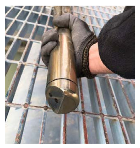
Turbimax CUS52D turbidity sensor installed in recovered water open channel, assembly installation is carried out in mechanical structure of the bridge of the thickener N°2