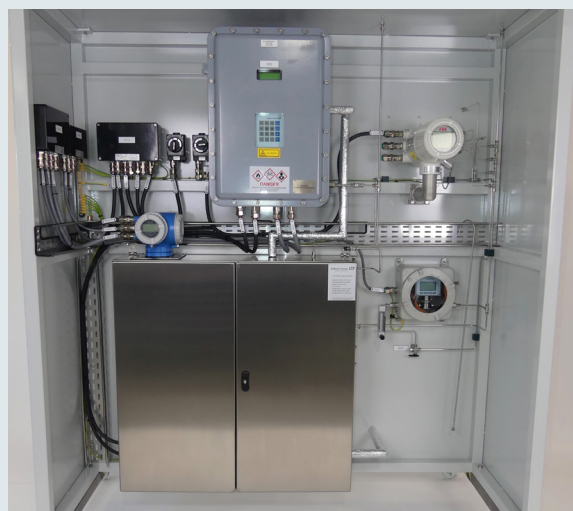
Endress+Hauser quality parameter analysis system

The proposed solution for this application is proven by the positive feedback obtained from hundreds of biomethane producers and gas grid operators with installed gas analysis systems in biomethane production and treatment plants throughout Europe and North America.