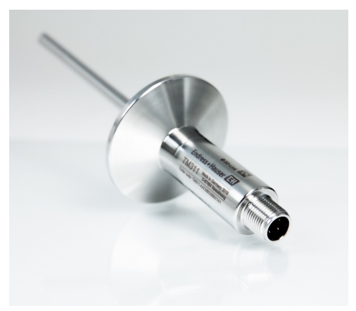
Figure 4: A food & beverage processor upgraded its inventory management system with Endress+Hauser instrumentation – including iTHERM TM311 temperature instruments (pictured) and others – leveraging Netilion, a cloud-based condition monitoring system, to ensure operational reliability.

By connecting the system to Endress+Hauser's Netilion cloud, the processor implemented condition monitoring, configuring