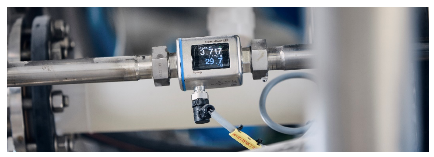
Figure 1: An Endress+Hauser Picomag electromagnetic flowmeter digitally transmits primary and secondary process variables—plus instrument diagnostic data—to a central host system via IO-Link.

While each of these digital protocols has ideal uses, IO-Link possesses a unique set of advantages for many applications, combining simple configuration, a standardized protocol, fast