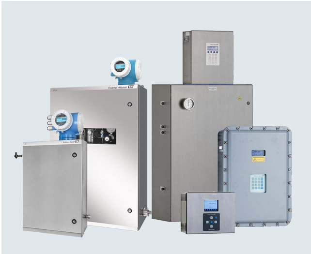
TDLAS and QF analyzers available for approval drawings