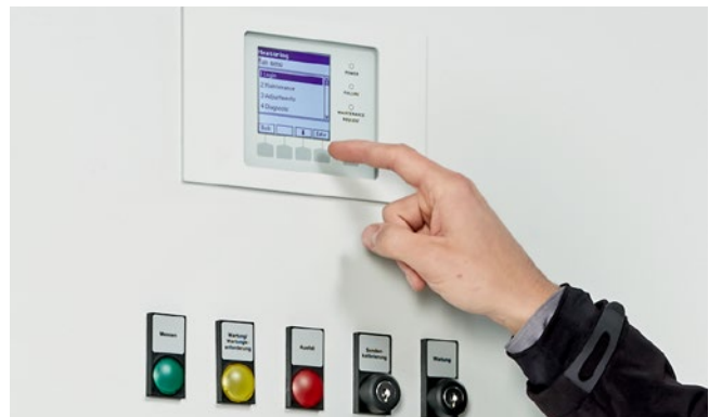
The user friendly operator panel (BCU control unit) makes working with the PowerCEMS100 easy.

The device is operated by the control unit BCU installed in the cabinet door. Clearly structured operator menus and the integrated keyboard facilitate work with the PowerCEMS100. The following menu languages are standard for selection: German, English, French, Spanish, Dutch, Swedish, Italian and Polish. This means that important functions can be performed in the respective language of the operator and parameters set easily corresponding to the requirements on site.