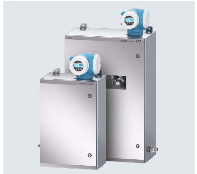
J22 TDLAS analyzer for H_2O measurement and JT33 TDLAS analyzer for H_2S measurement