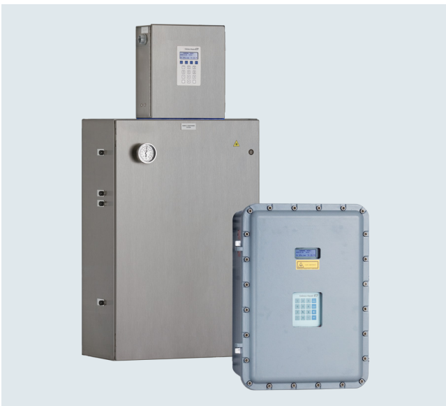
SS2100 TDLAS series analyzers for H_2O , H_2S , and CO_2 measurement