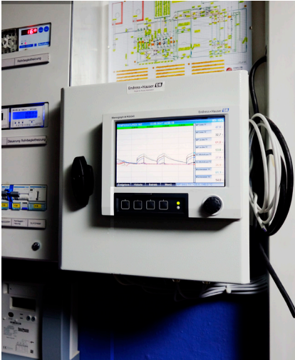
Memograph M RSG45