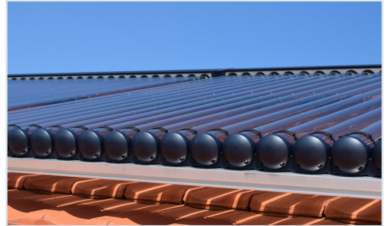
Thermal solar system

Omlin Energiesysteme AG provides innovative and individually tailored solutions to its customers. An intelligent monitoring system is part of any smart energy system comprising various heating components. The monitoring system records process values correctly and clearly presents them on a display.