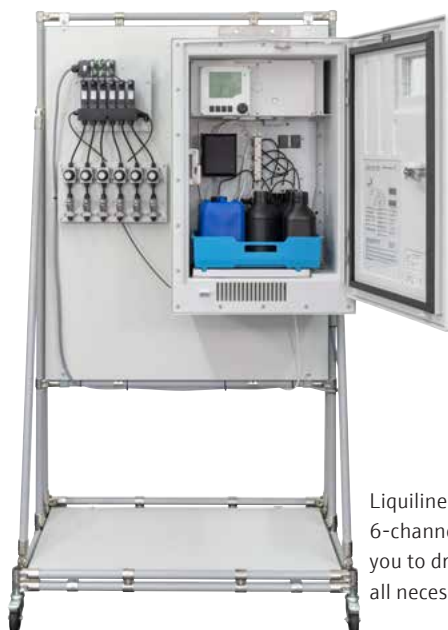
Liquiline System CA80SI 6-channel version: Allows you to draw samples from all necessary process points.

Online measurement of silica in feed water returning from the condenser to the boiler allows an early detection of impurities and helps spot cooling water leaks inside the condenser.