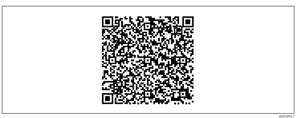
I QR code for the Applicator "Sizing Pressure Performance"