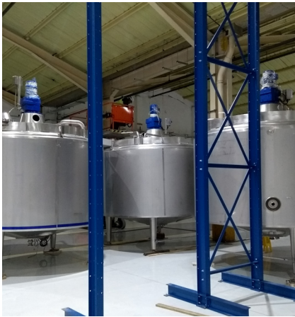
Downstream wash tanks

runs quickly, easily and with reliability of accurate readings when restarting. The maintenance with Memosens is really easy,” says Connor.