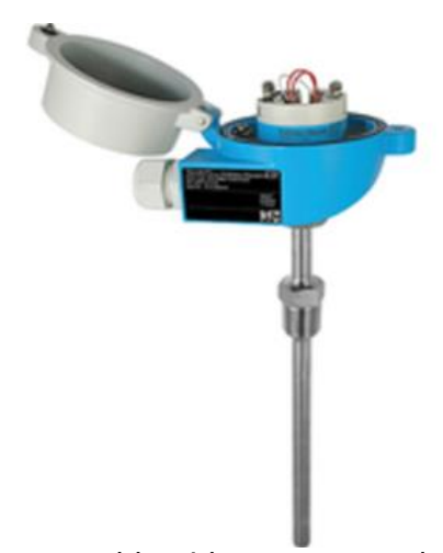
Assembly with convertor and sensor