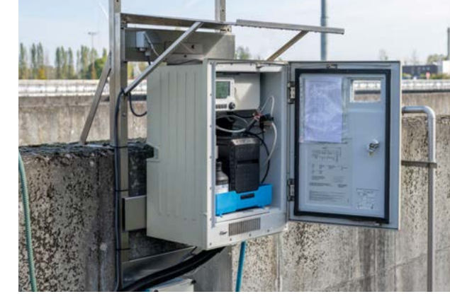
Orthophosphate analyzer Liquiline System CA80PH reduces costs for operators by 50%.