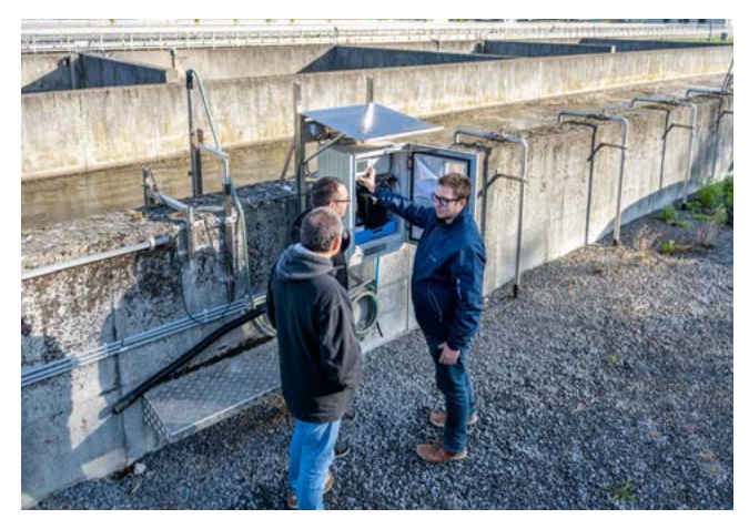
Endress+Hauser experts support the IDEA team by providing training on the orthophosphate analyzer