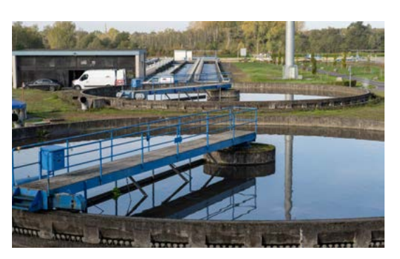
Pierre Bronchart, Chemical Engineer

In many areas of work, the demands on quality are constantly increasing. This is also the case in the field of wastewater treatment. The limit values are regularly analyzed and reviewed. The IDEA (Intercommunale de Développement Economique et d'Aménagement du Coeur du Hainaut) in Belgium also supports this approach in order to create optimal conditions for wastewater treatment and thus guarantee the safety of the inhabitants of Wallonia.