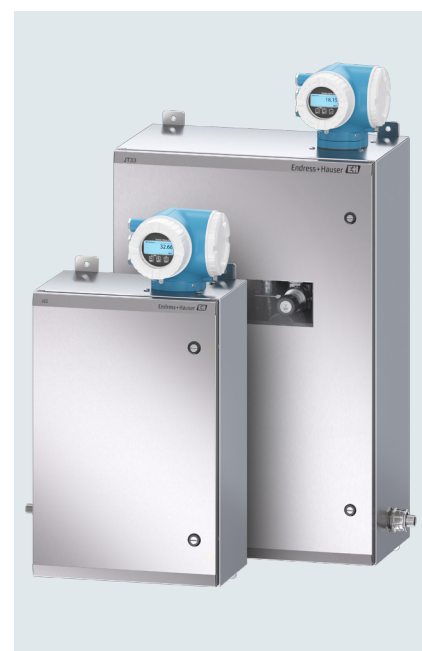
J22 and JT33 TDLAS gas analyzers

After biogas is processed, the concentration of methane is 97–99%, earning the name biomethane. Once the gas is processed to biomethane, it