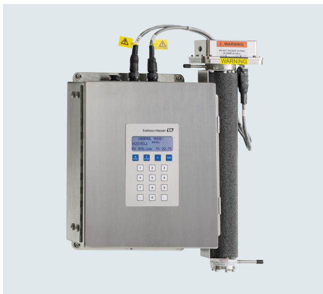
SS500 TDLAS analyzer for H_2O measurement

Simply enter the title in the "Find Products, Downloads, and more..." search field at www.endress.com .