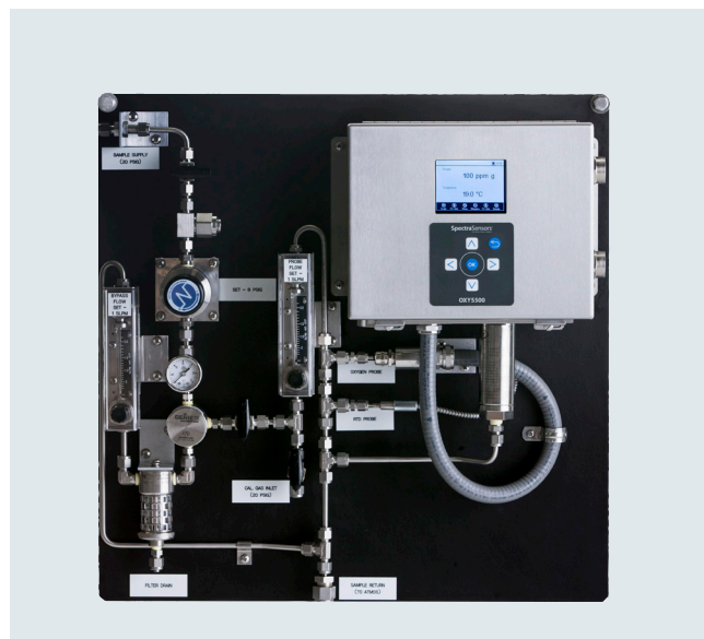
OXY5500 QF analyzer for O_2 measurement