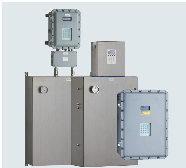
SS2100 TDLAS series analyzers for H_2O , H_2S , and CO_2 measurement