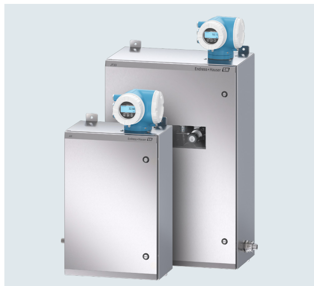
J22 TDLAS analyzer for H_2O measurement and JT33 TDLAS analyzer for H_2S measurement