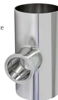
Flow assembly Flowfit CUA262