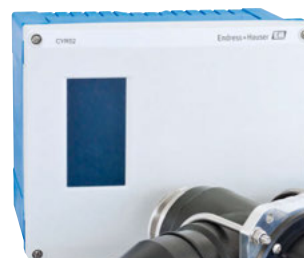
Flow assembly Flowfit CUA252 with ultrasonic cleaning CYR52