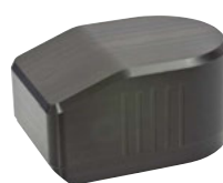
Solid state reference CUY52