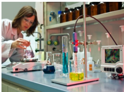
Calibration of Memosens sensors in the laboratory

A central laboratory has been set up and equipped with a computer-aided pH calibration bench in order to manage the extensive base of pH measuring equipment. The tasks are clearly defined: the operators recover and replace the on-site sensors – certain installations are difficult to access – and the measuring specialists take care of the laboratory maintenance and calibration work. This reduces time spent on on-site maintenance by over 50%.