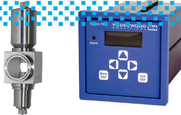
AF12 inline sensor with Model 910 analyzer