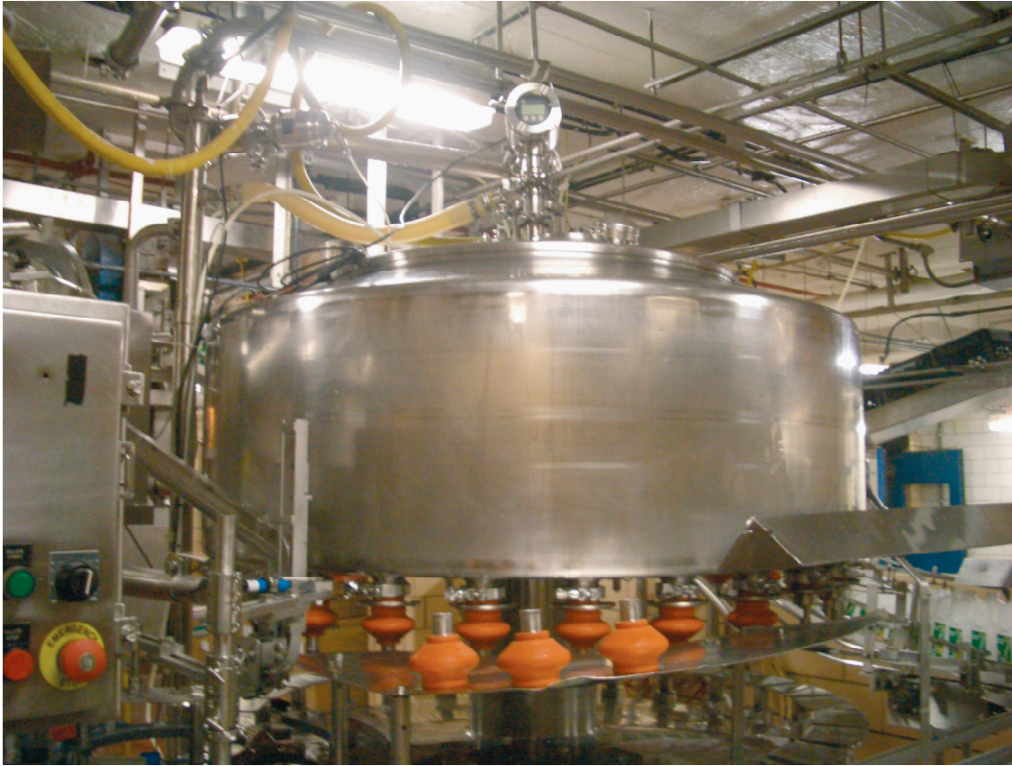
Levelflex M FMP40 on filler bowl