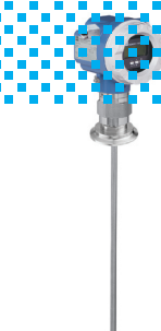
FMP40 with TSP Tri-clamp fitting