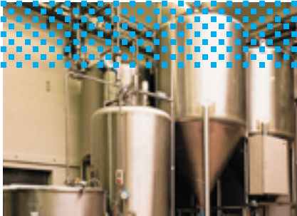
Typical small SS tanks