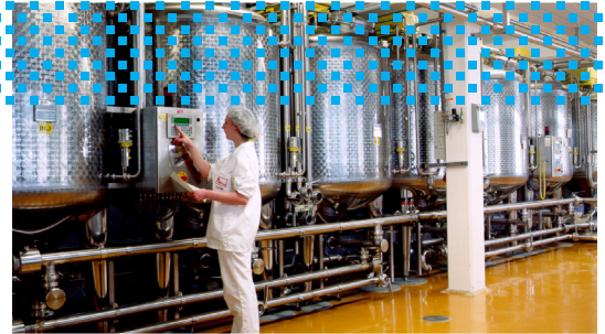
Checking levels in bio-storage vats

The guided wave radar Levelflex M FMP 40 is used to measure level in a bioreactor.